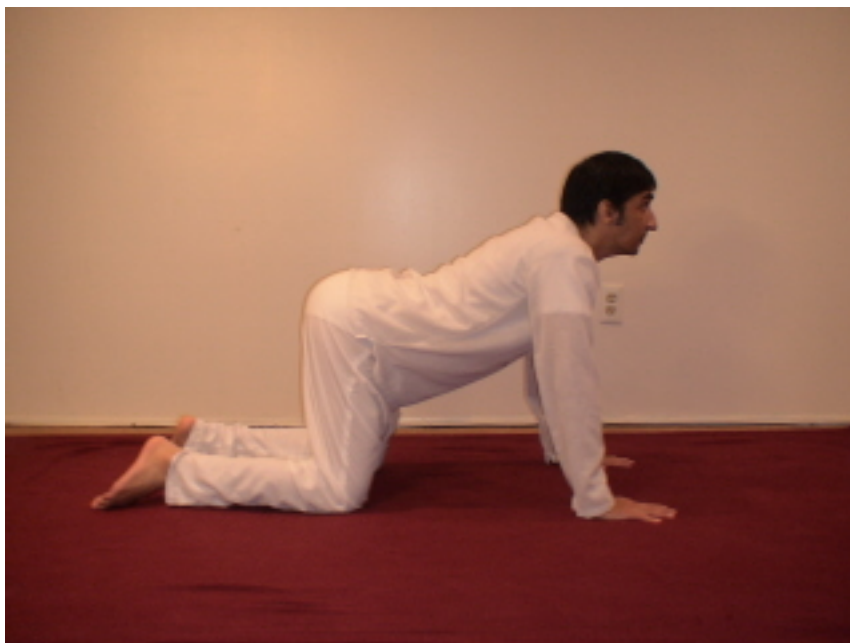
Yoga Cow Pose (Inhale)