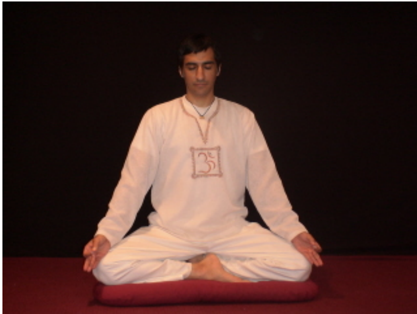
Hindu Meditation Posture