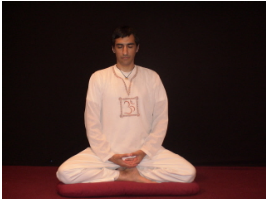
Buddhist Meditation Posture