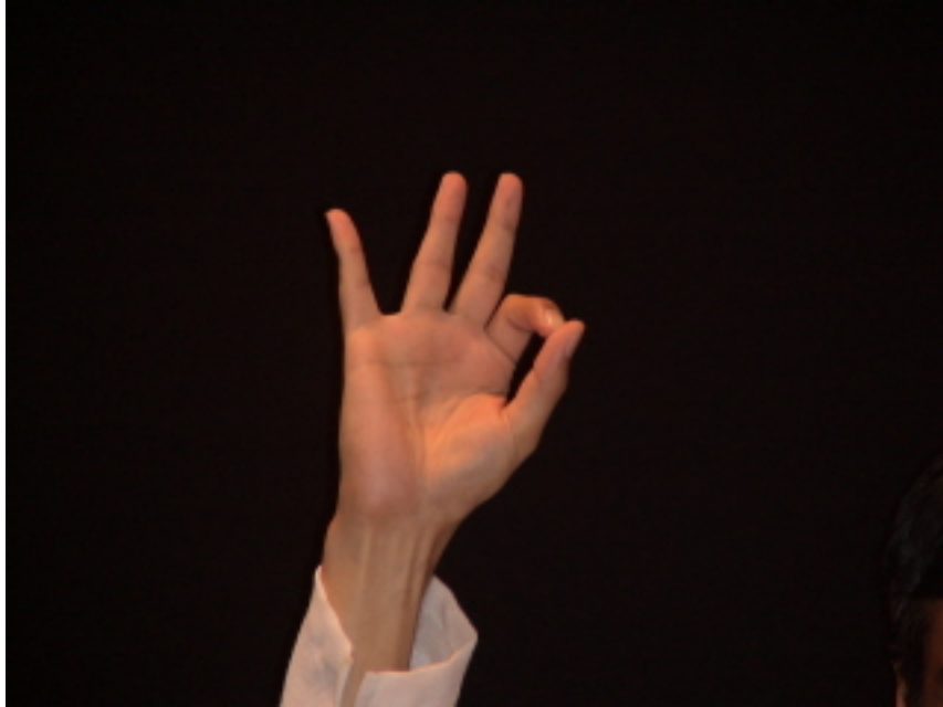
Hindu Meditation Mudra - Gyan Mudra