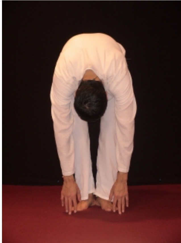
Yoga Frog Pose (Exhale)