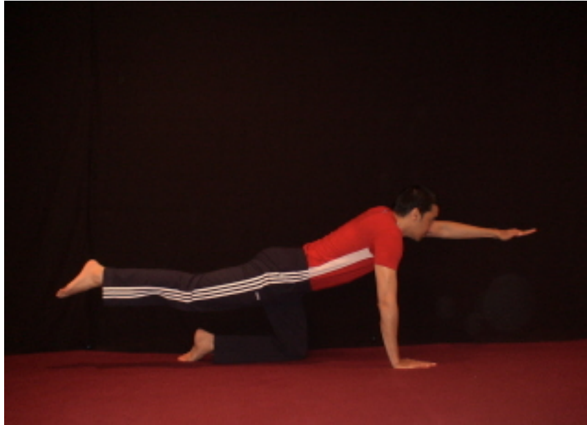
Basic Yoga Pose for Balance (Left Arm)