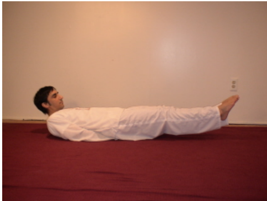
Picture of Kundalini Yoga Stretch Pose