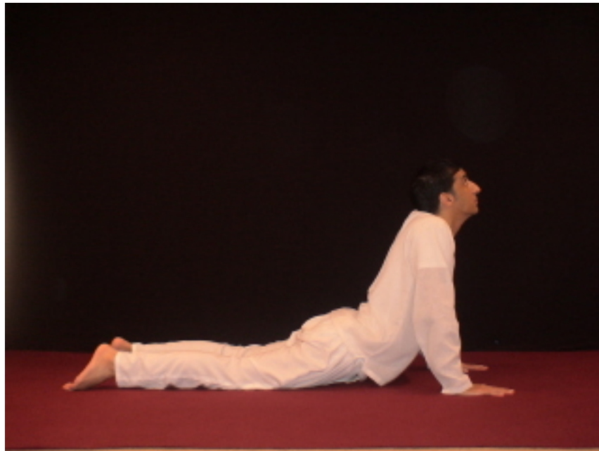
Cobra Pose w/ Straight Elbows