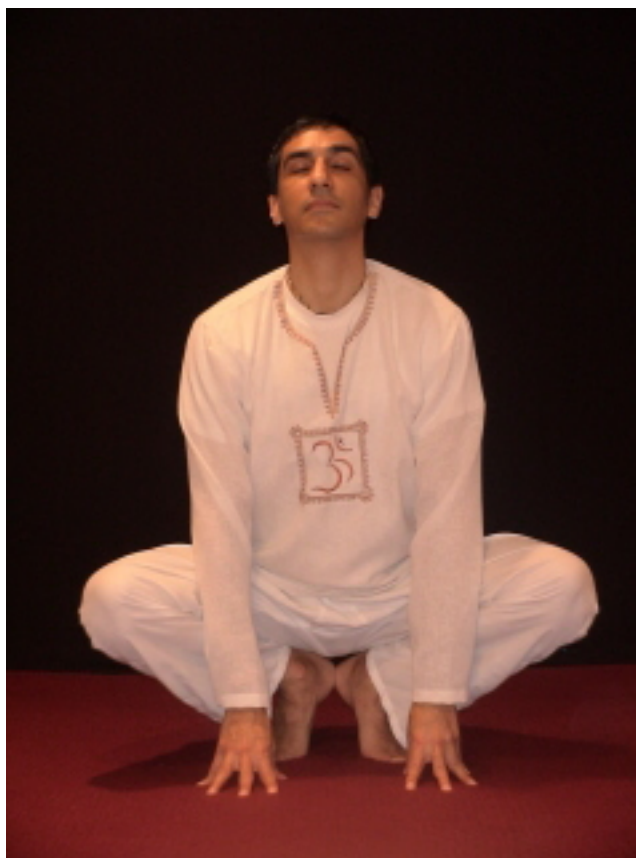
Yoga Frog Pose (Inhale)