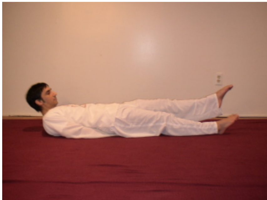
Picture of Beginner Kundalini Yoga Stretch Pose