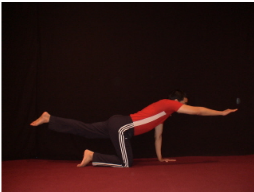
Basic Yoga Pose for Balance (Right Arm)