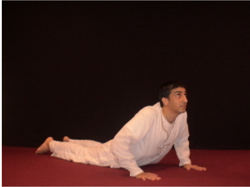
Cobra Pose w/ Bent Elbows