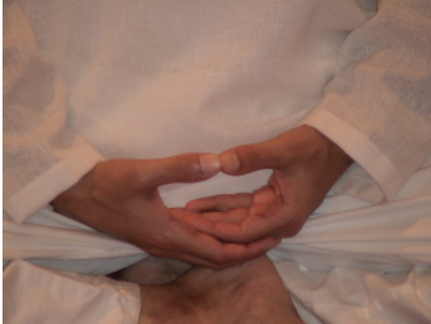
Buddhist Meditation Mudra - Cosmic Mudra