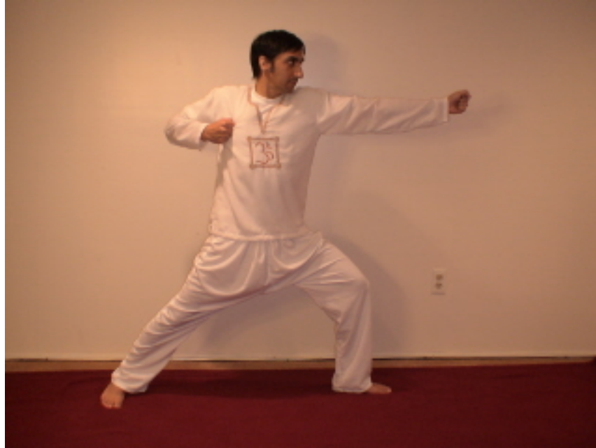
Yoga Archer Pose