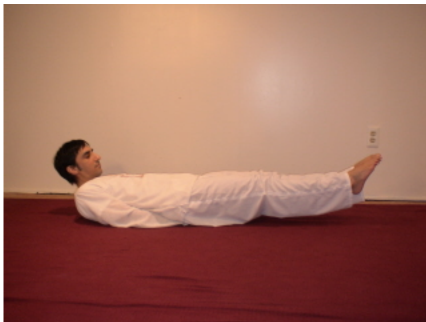
Kundalini Yoga Stretch Pose