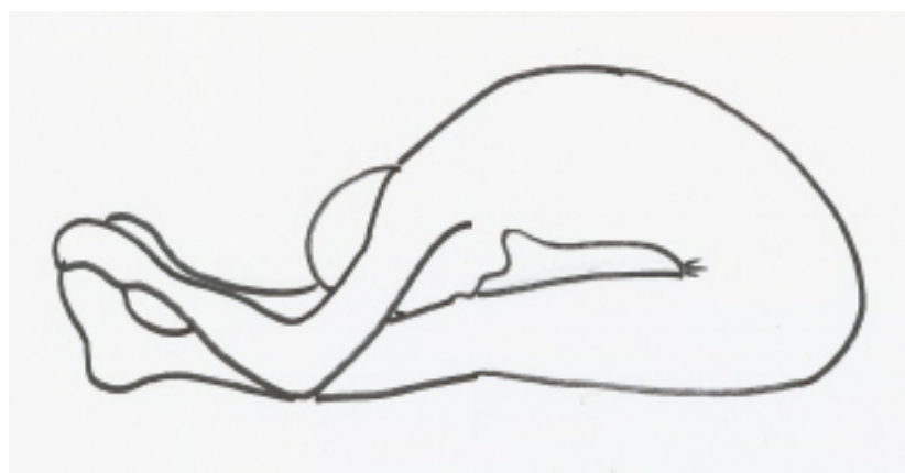
Forward Bending Yoga Pose