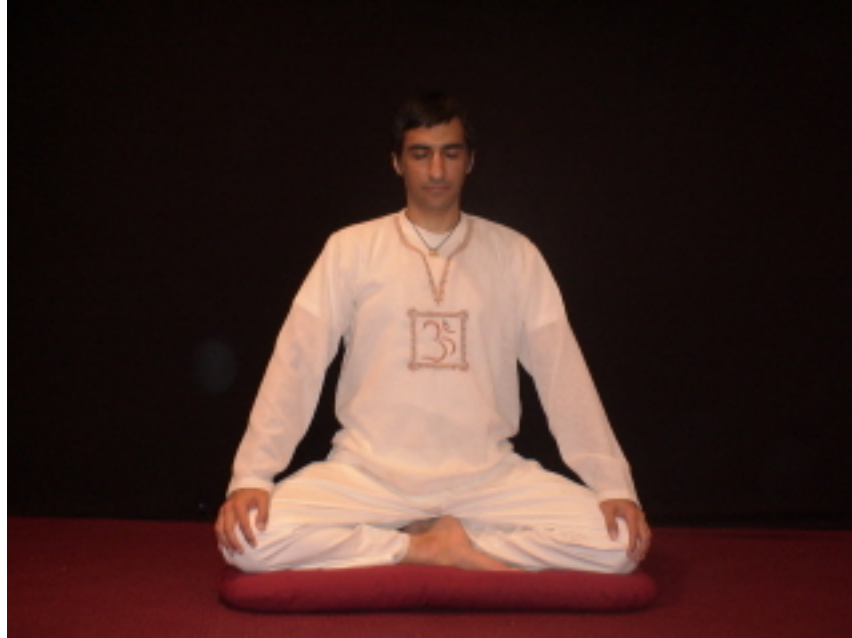
Basic Meditation Posture