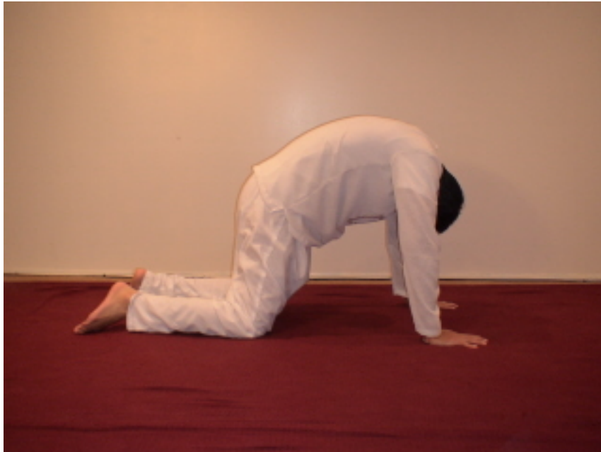
Yoga Cat Pose (Exhale)