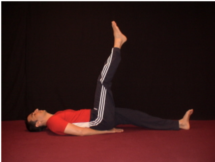
Yoga Single Leg Lifts (Right Leg)