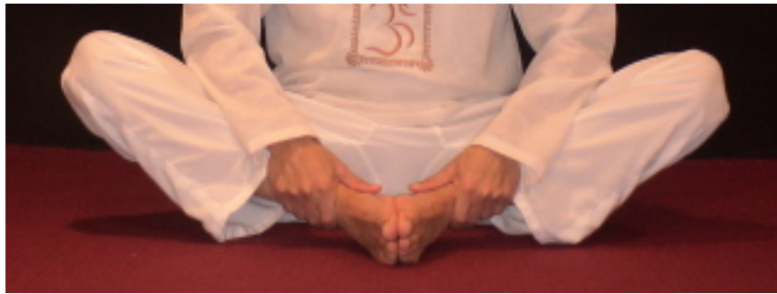
Picture of Yoga Butterfly Asana 2