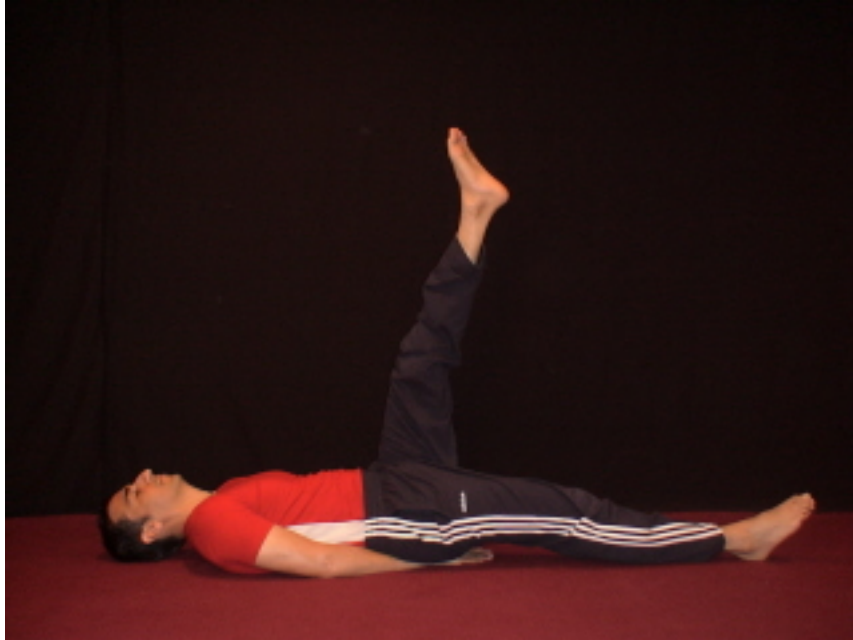
Yoga Single Leg Lifts (Left Leg)